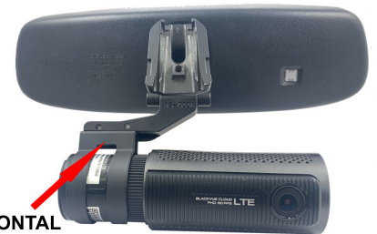
SPRING CLIP HORIZONTAL ADJUSTMENT SCREW

3 - Using the upper and lower pivot screws, adjust the mount to achieve your desired location of the dashcam. We recommend adjusting it as high as you can. You can also use the spring clip horizontal adjustment screw to help center the dashcam with the mirror as shown above.